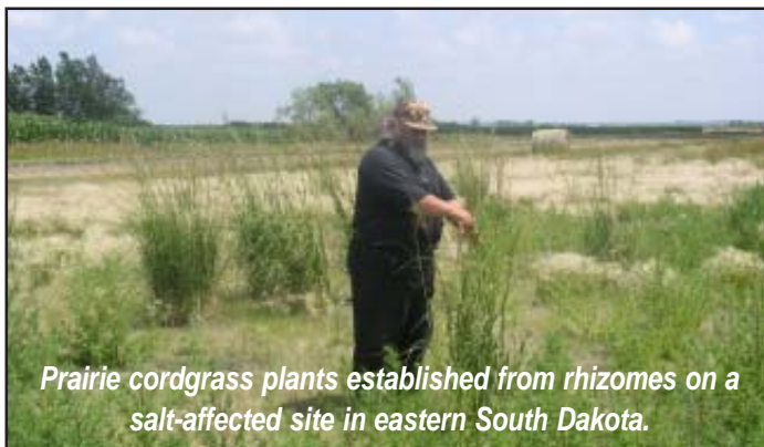
Prairie cordgrass plants established from rhizomes on a salt-affected site in eastern South Dakota.